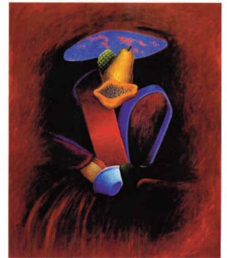
The Dutch Jew 1993, acrylic on canvas, 123.6 x 100 cm