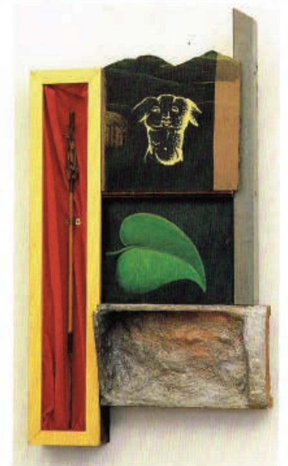
America 1988, assemblage, 82 x 46 x 12 cm