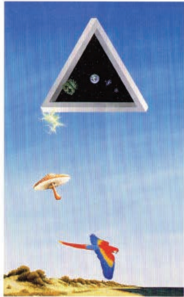
Reality 1993, acrylic on canvas, 161.8 x 100 cm