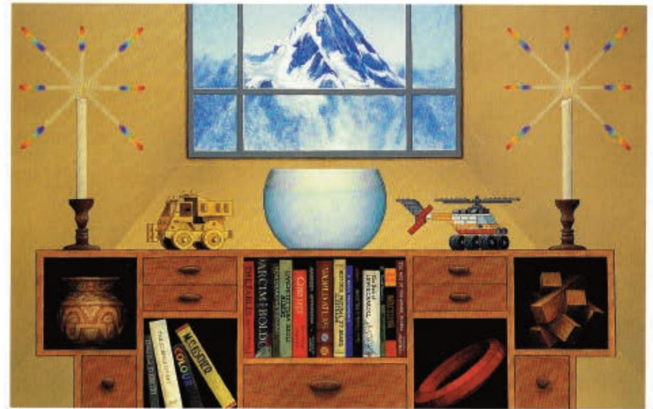
The First Impression 1993, acrylic on canvas, 100 x 161.7 cm