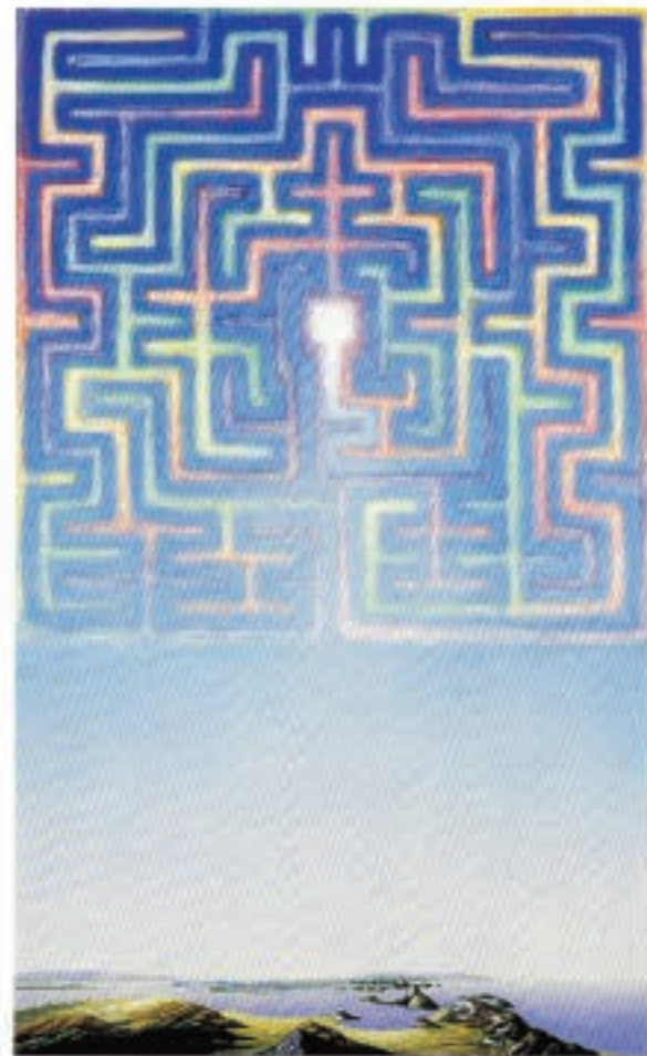
The Challenge 1993, acrylic on canvas, 161.8 x 100 cm