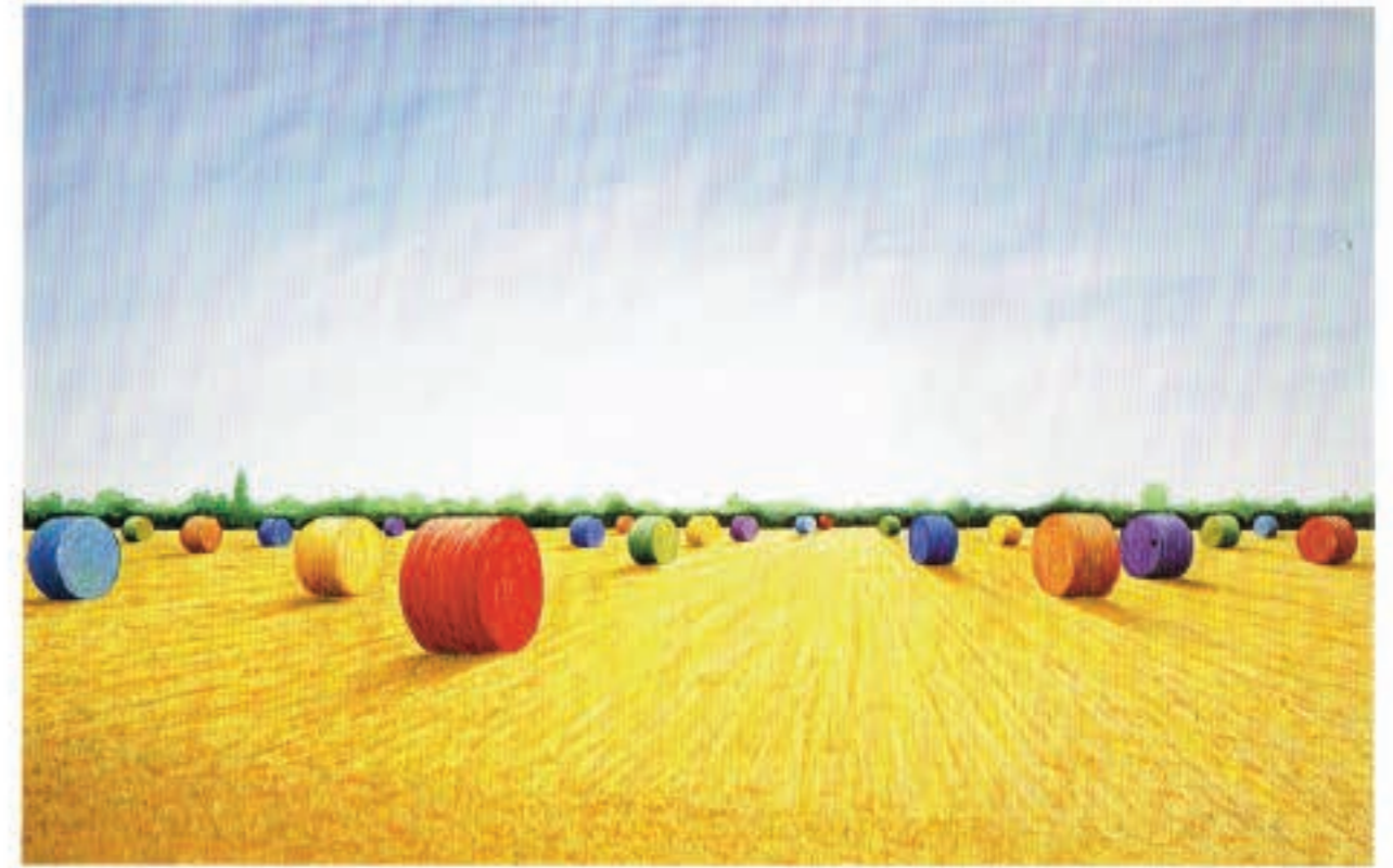
Rainbow Fields 1993, acrylic on canvas, 110 x 161.1 cm