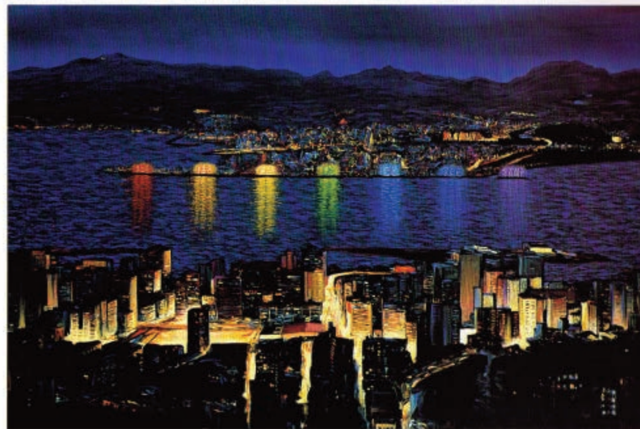
M idsummer Night Rainbow in Hong Kong - 1994, acrylic on canvas, 150 x 200 cm