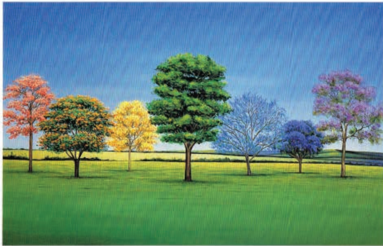
Rainbow Trees 1994, acrylic on canvas, 100 x 161.8 cm