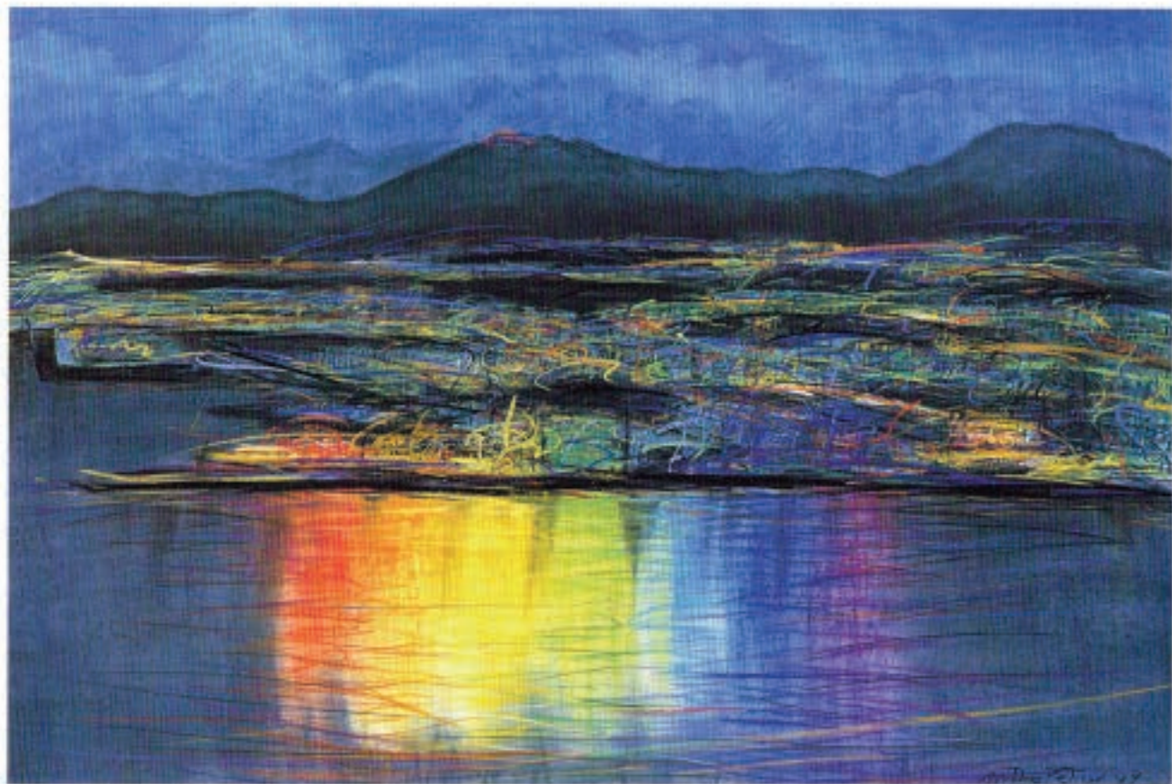
H ong Kong à Noite - 1994, pastel on paper, 60 x 95 cm