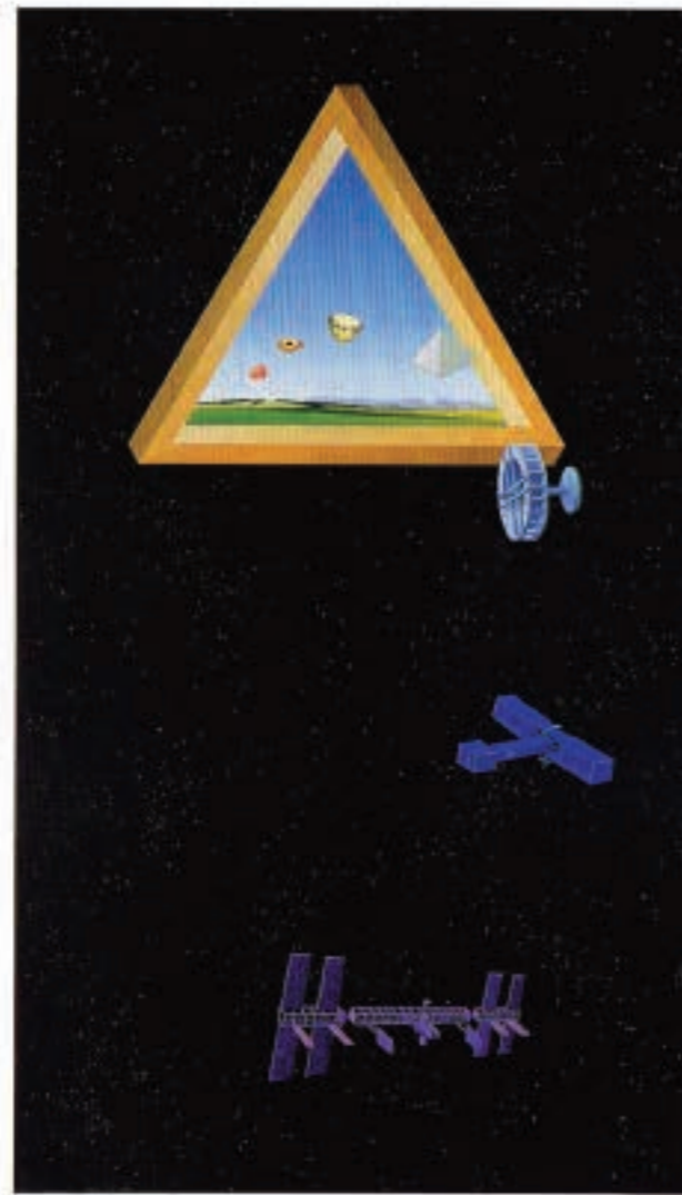
Dreams 1993, acrylic on canvas, 161.8 x 100 cm